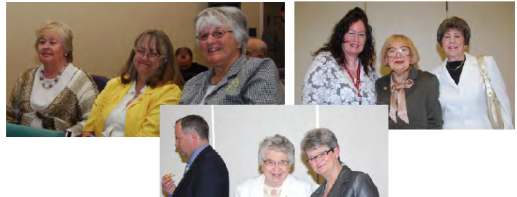
A full house for this year's Foundation donor ceremony! Many of the CMH Foundation donors attended the annual ceremony.